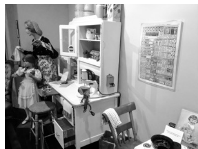
Chagrin Falls 1940's Museum Exhibit