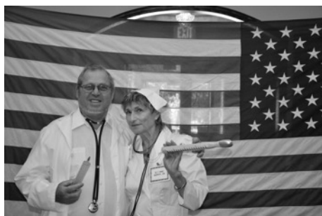
Gala Medical Staff