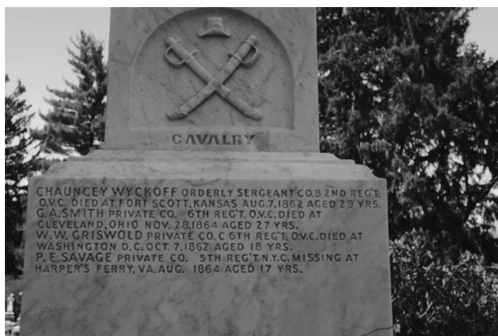
Each face of the monument lists the dead and missing from a specific branch of the service.