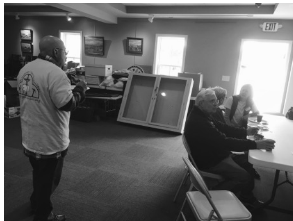
Volunteers from Holy Angels taking a break after moving items from our old museum to our new one.

'Hairless' Bo and Scrap engaging in their pregame ritual of proclaiming the honesty of the 'crank' while slipping him a bribe.