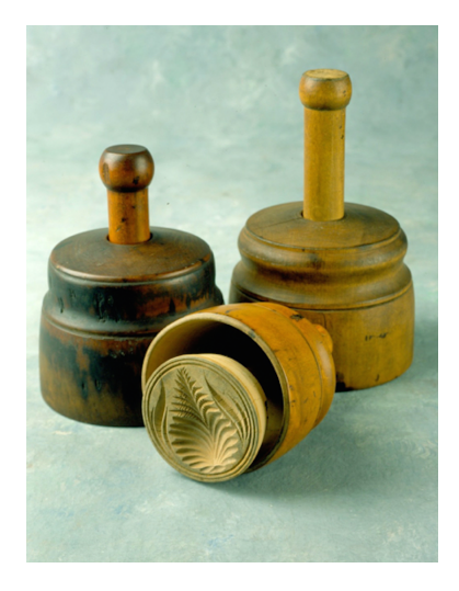
Bullard Butter Molds