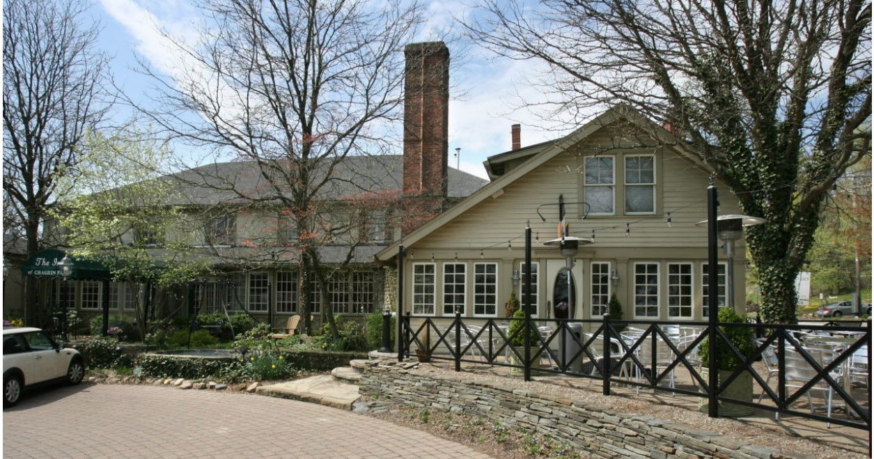
The Cottage today as Game Keeper's Tavern (left, closed in 2017,) and the Inn of Chagrin Falls (right.)