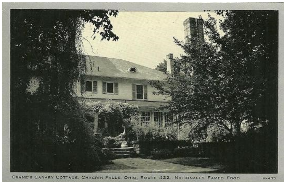
Exterior of Crane's Canary Cottage,