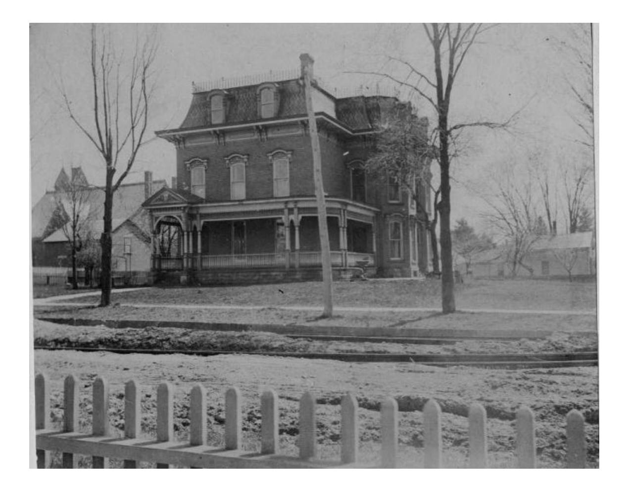
The family's historic home is now the Chagrin Falls Village hall.